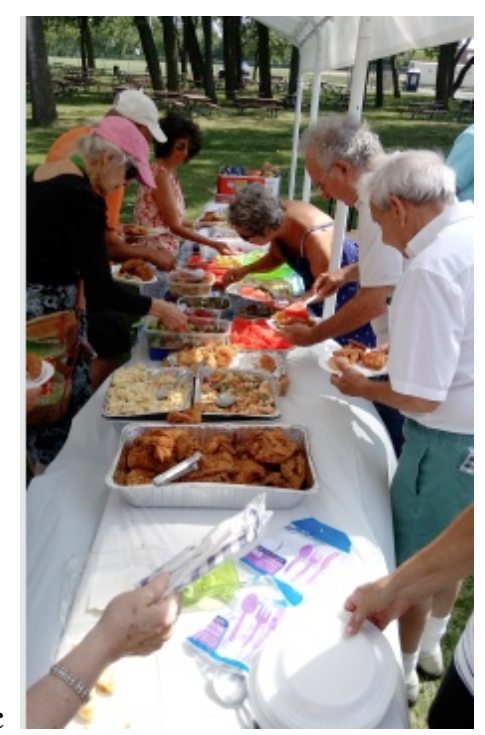
Chicago Jitterbug Club Picnic